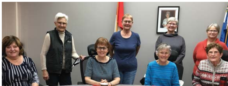
Fountain of Health - Trochu

Community Volunteer Income Tax Program, Grief Care Packages, Take Home Kits, Just in Case, Adult Art Group, Seniors Coffee Break, Dementia Bags, Seniors Resource Bags, Kneehill Family Wellness Workers, Seniors Outreach