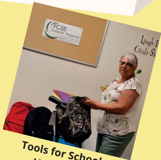
Tools for School Volunteer

$ 1,223,496.00 in credits, benefits and refunds for CVITP clients