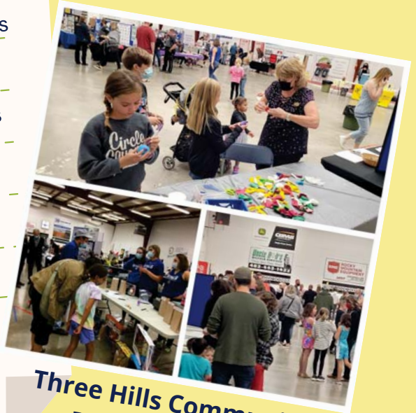
Three Hills Community Discovery Night