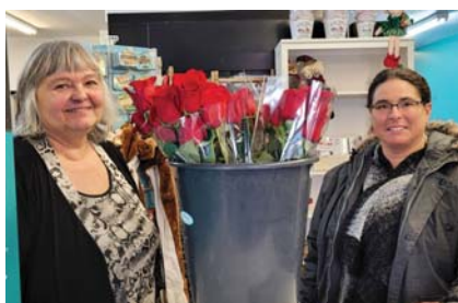
Red Rose Campaign