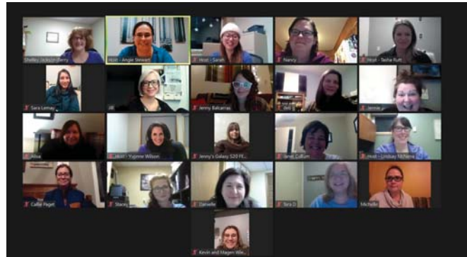
Online Parent Café Participants

Triple P - Fear Less, Birthday in a Box, Tools for School, Kneehill Family and Marriage Counselling