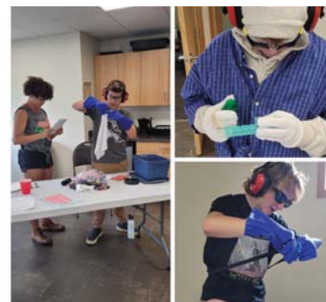
Dementia Friendly Communities

Kneehill Community Services Directory, Information/Referral, Kneehill Interagency, Community Discovery Night, Rural Mental Health Initiative, Youth Community Assessment, Kneehill Child and Youth Working Group, Volunteer Kneehill, Youth Community Assessment, Kneehill Child and Youth Working Group