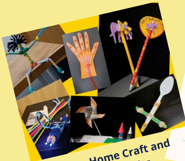
Take Home Craft and Science Kits

323 participants in FCSS youth programs and activities (summer programs, art groups, take home craft and science kits)