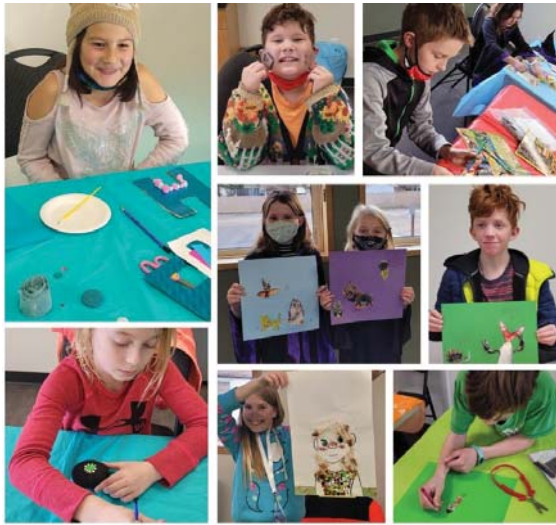
Youth Mindful Art Program