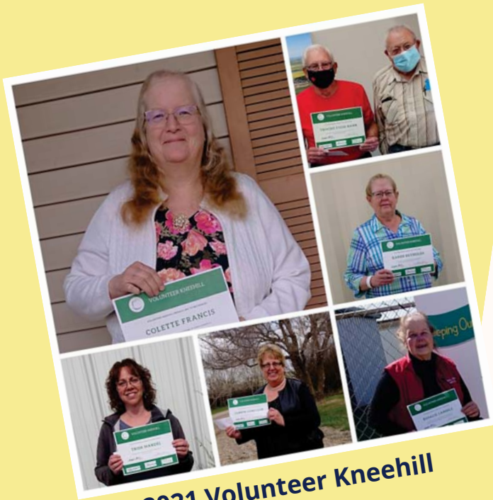
2021 Volunteer Kneehill Recipients

22 Volunteer Kneehill Nominations were received