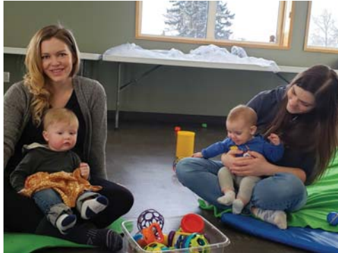
Baby Banter families